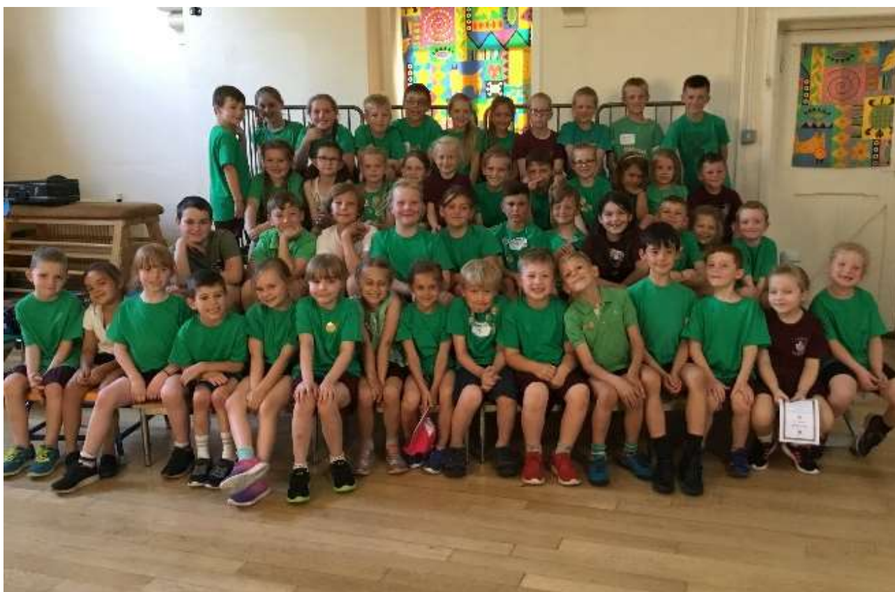
Emeralds win sports day