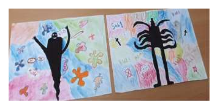
Well done Year 6- what fantastic poems and artwork.