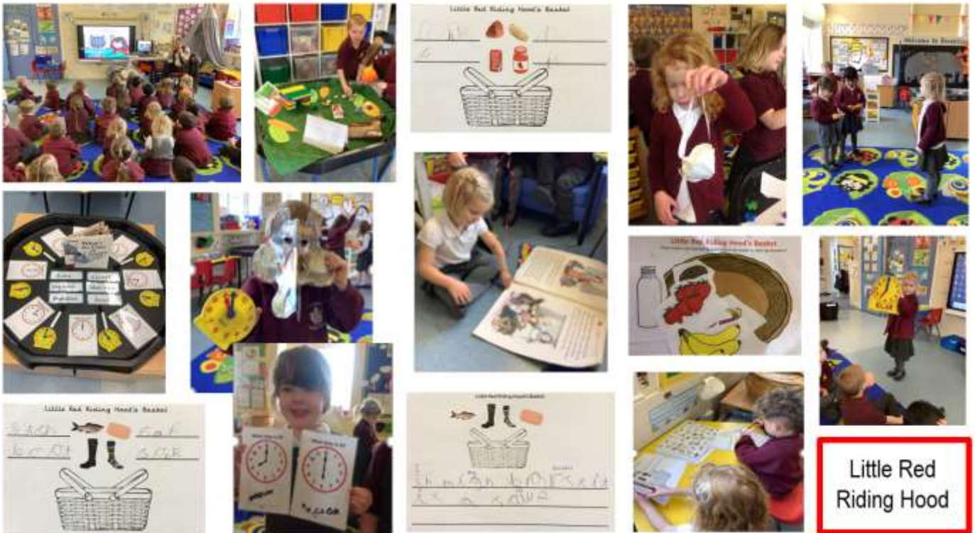
Little Red Riding Hood

We still hope to get our Woodland Wednesday Visits up and running this term as the topic lends itself perfectly to so many woodland activities. Thank you to your continued support with this.